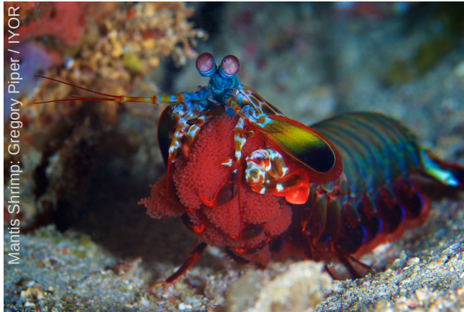
Mantis Shrimp: Gregory Piper / IYOR